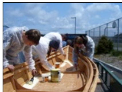
Painting the inside yellow