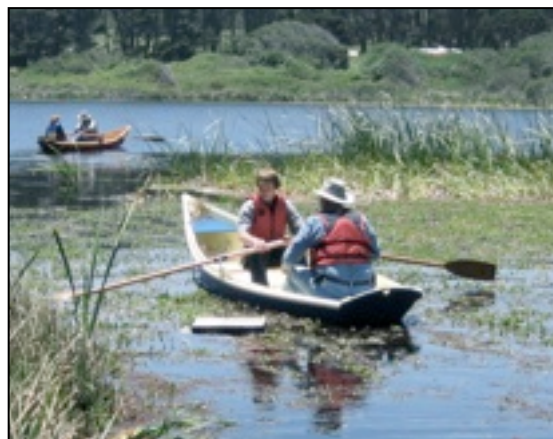
Right, Maiden voyage of The Cove