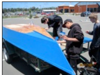
Painting the blue hull