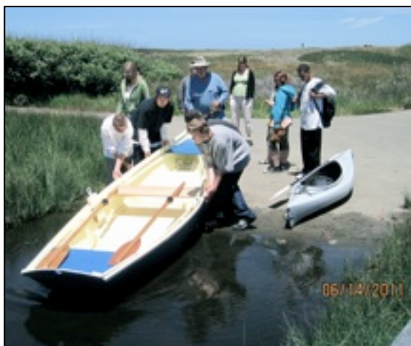
Left, Splash down at Lake Cleone