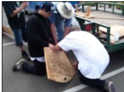
Attaching the transom

Thanks to all of you that helped in any small or large way with this