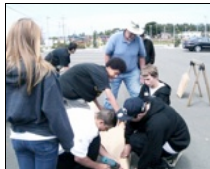
Attaching the bow stem

successful project. After all some one had to teach me how and what to do and get the kids program launched. Now it's time to Splash Down! See photos below.