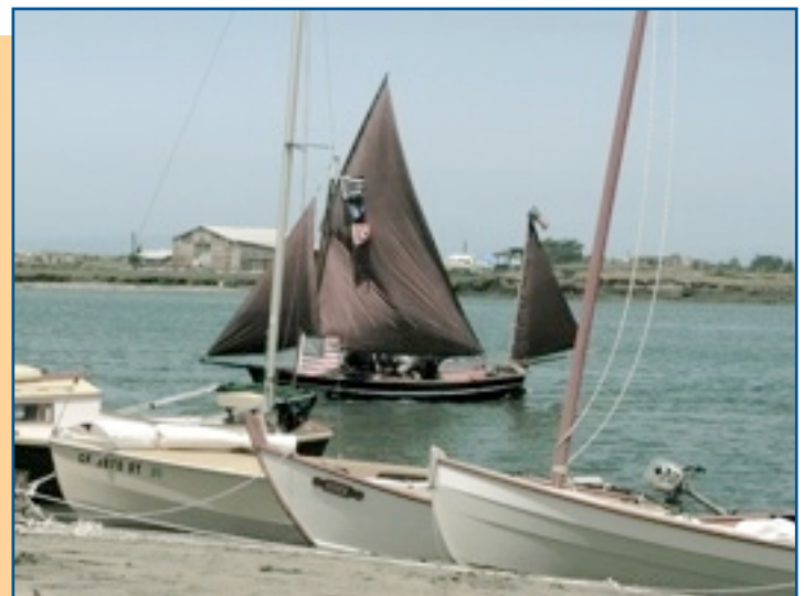
ELKHORN SLOUGH